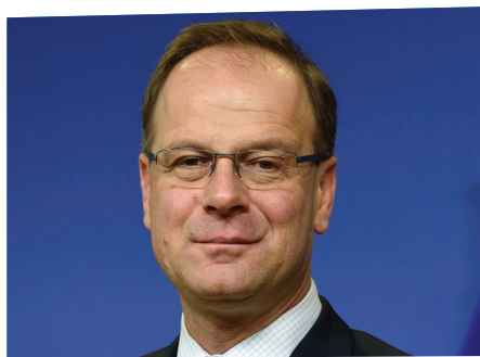
Tibor Navracsics European Commissioner for Education, Culture, Youth and Sport