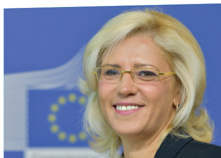
Corina Crețu European Commissioner for Regional Policy

All European territories can play a distinctive and important role in the European Union's efforts to secure sustainable economic growth, competitiveness and progress. We are looking forward to seeing where their creativity and determination lead them.